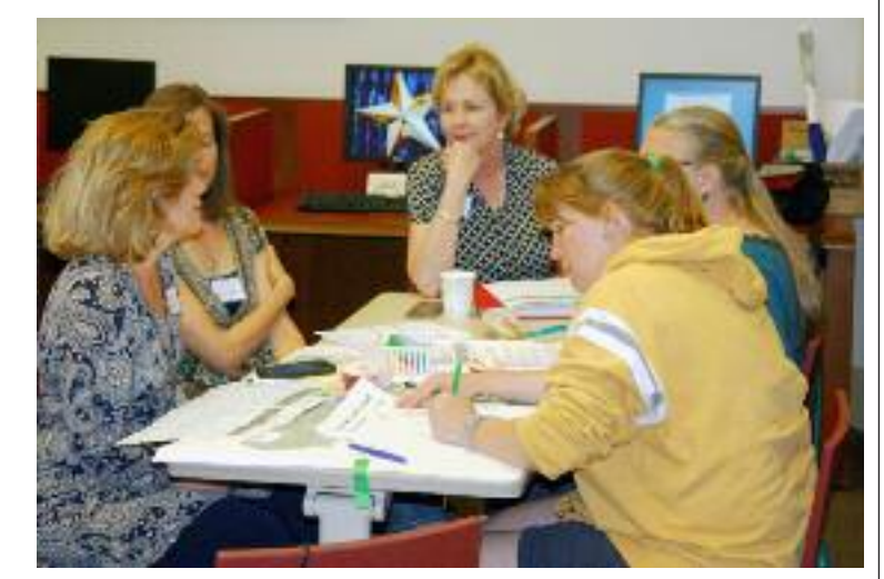
Lafayette residents gather at the March 19 Community Conversation meeting to discuss the future of their city.